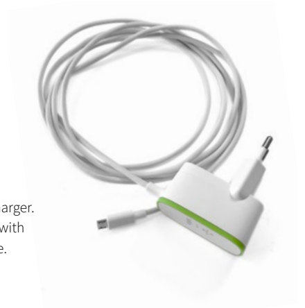
The Mobile Power Charger. A Micro USB charger with powerful performance.