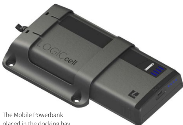
The Mobile Powerbank placed in the docking bay